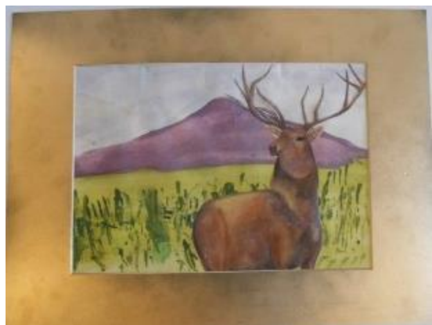
Examples of art and technical work